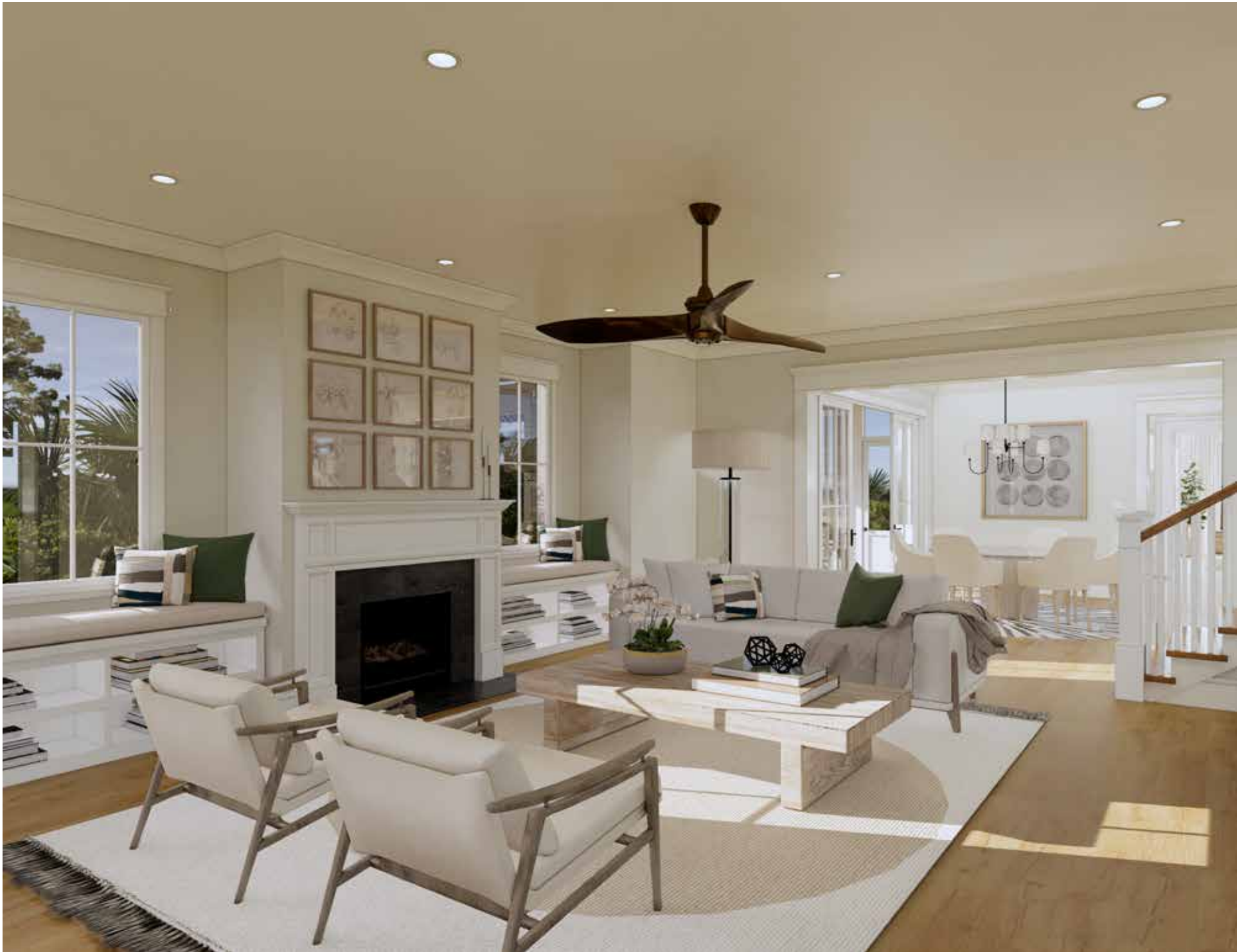
Simulated interior rendering, please confirm actual finishes with the Artisan representative.